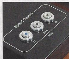
Electronic Speed Control