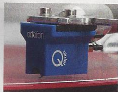
Optional Ortofon Quintet Blue MC Phono Cartridge