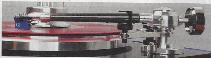
9" Carbon Fiber Tonearm with Aluminum Headshell