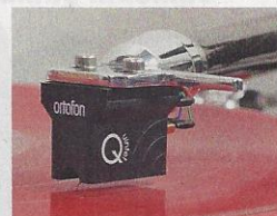
Ortofon Quintet Cartridge