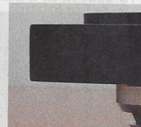
Super-Flat 'Sandwich' Chassis Design